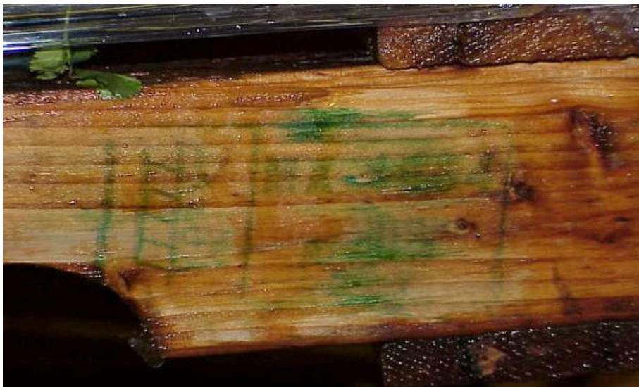
Illegible WPM Mark